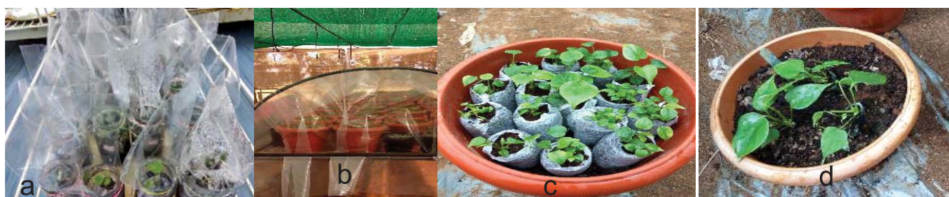
Fig 2. Acclimatization of micropropagated Anthurium plants. (a) Plants acclimatized under artificial light and room temperature in growth chamber for 30 d - primary hardening (b) Secondary hardening plants in humidity chamber of green house (c) plants after 60 d of secondary hardening (d) plants in potting mixture after 90 days of potting.